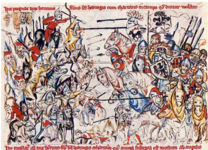
Battle of Legnica. European medieval miniature.

Having dealt with the Christian Russian principalities, the troops of Siberian Russia simultaneously invaded Poland with the invasion of Hungary. The cities of Poland are falling one by one under their onslaught. The "West", trying to rectify the situation, pulled together to help the Polish prince the main forces of the chivalry of Europe, which was planned after the liquidation of the Roman Empire to seize the lands of the Christian princes during their feuds and to convert the population to Catholicism, turning their lands into a continuation of the Catholic world of Europe. The hierophants decided to stop the Russian offensive on the territory of Poland and give a decisive battle. German, Austrian, French, Italian, and even Spanish knights arrived to help the Polish knights. Under the leadership of Prince Henry II of Poland, a 60-thousand-strong combined Polish army with European mercenaries and European chivalry, including Teutons, Templars and Hospitallers, acted. To help Henry, the Czech king Wenceslaus went with an army of about 50 thousand soldiers under the Czech knights. The European army was opposed by a 25 thousand Russian army under the command of Baydar.