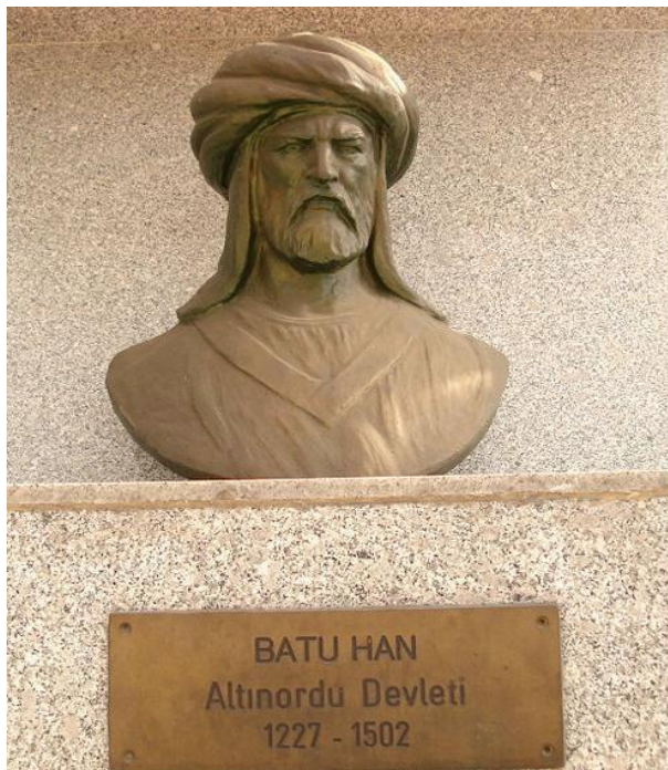
Bust of Batu Khan in Sogut, Turkey

Kirghiz - as belonging to the Slavic-Aryan military class of cattle breeders; Turk - as a mountaineer; Mongal - as a descendant of immigrants from the Mongal skete on Tartarus; and a white man by blood. Tsar Batu minted his coins with the Sign of the Trident-the heraldry of the Mongolian Family of Temir, as well as the Sign of the Rurik Family, as well as the coat of arms of Ukraine today.