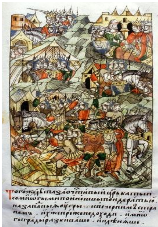
Bottom line (again, I apologize to the author for shortening the text):

The campaign of King Batu to Venea in the Summer of 6749