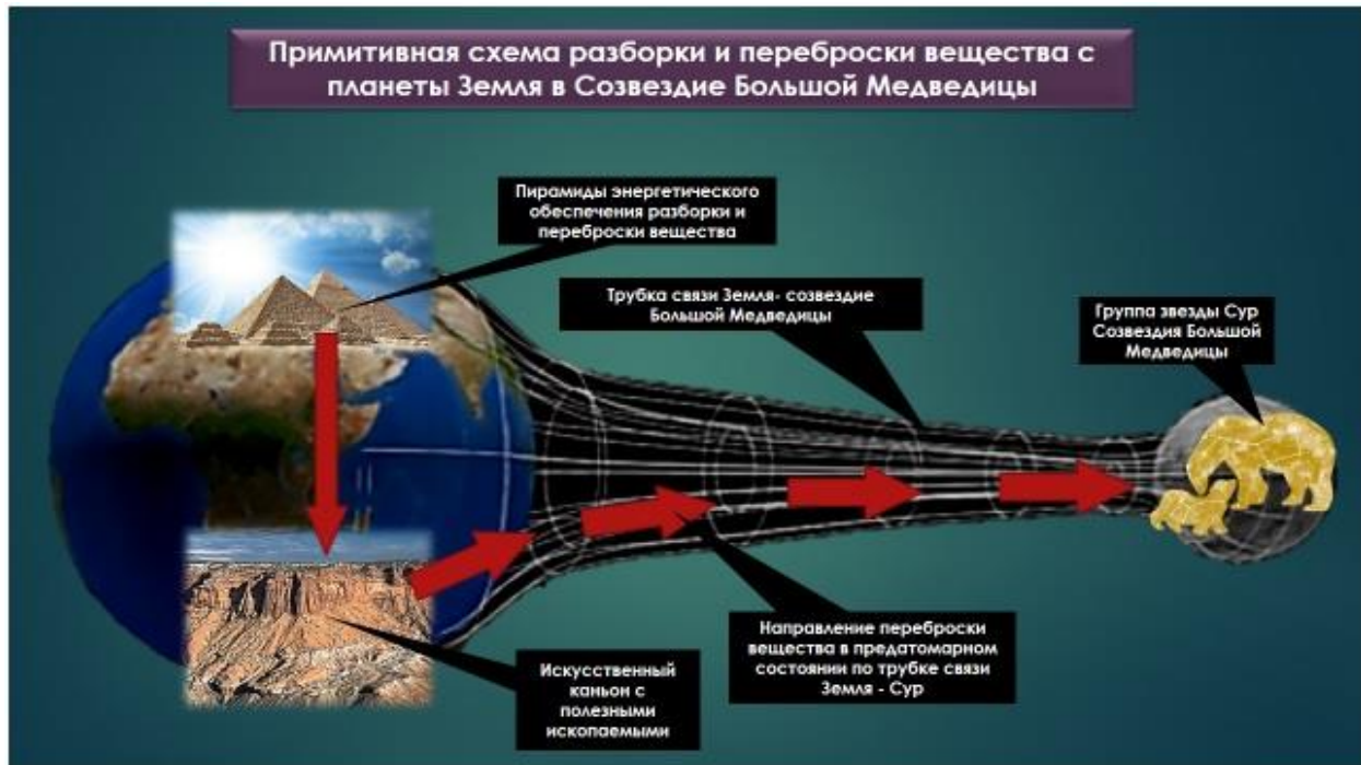
Primitive scheme for disassembling and transferring matter from planet Earth to the Constellation Ursa Major

Top: Left To Right - Pyramids of energy supply for disassembly and transfer of matter → Earth – constellation Ursa Major Communication tube → Star troupe Sur Ursa Major Constellation