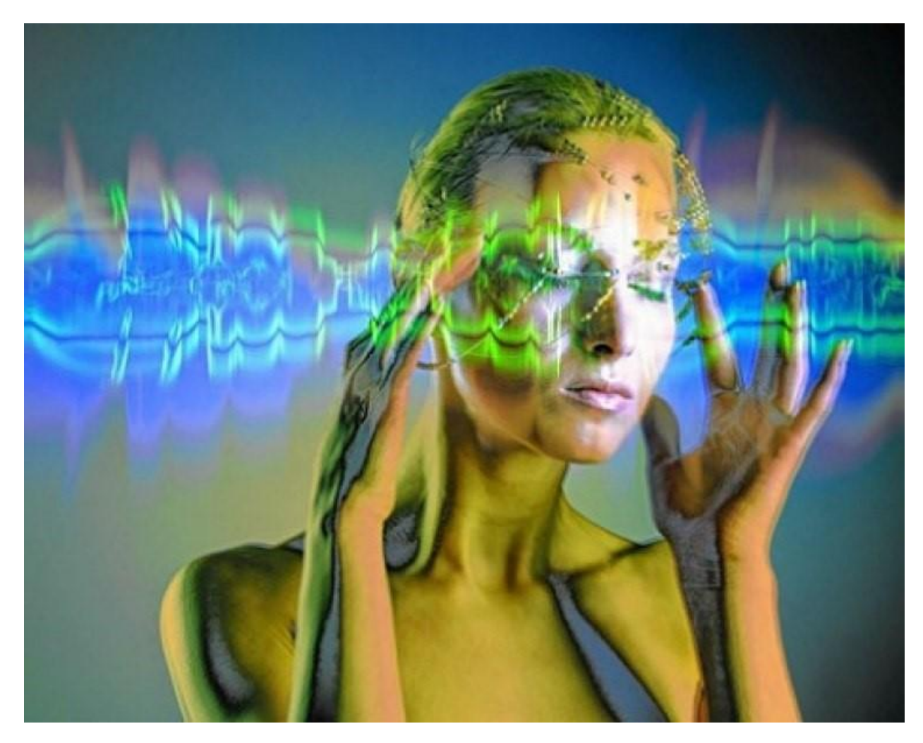
One of the keywords of the article : "Everything happens in public and not in public. But no one can stop processes that are already running.

Yes, and these processes are manageable. This is a kind of self-defense of an intelligent civilization in the form of CPS. Obviously, more than one civilization perished at the initial stages of its development, without reliable protection. And this protection was created by more advanced civilizations.