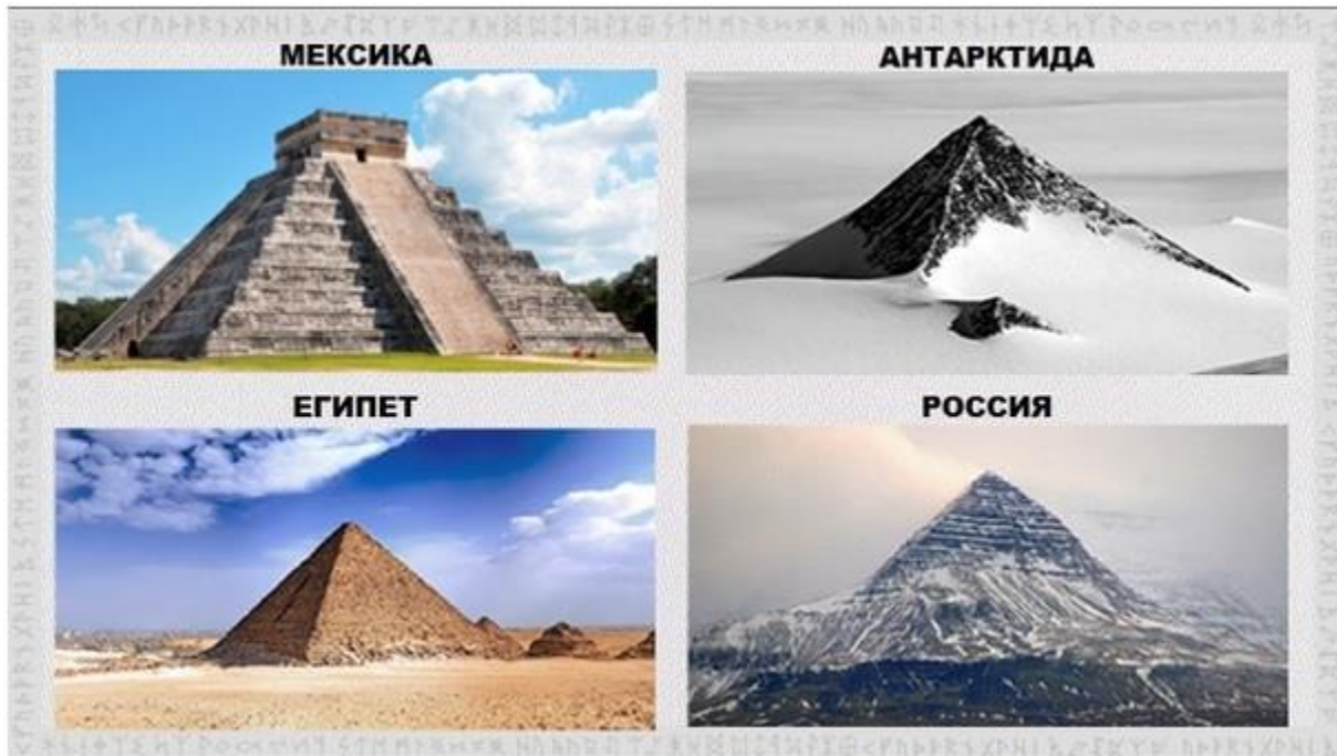
Mecca – Antarctica – Russia – Egypt

Pyramids are lenses with the help of which the distribution of energy flows changed, increasing the stability of the planet, i.e., they are a type of stabilizer of the Earth's magnetic field, removing the possibility of a strong vibration of the Planet.