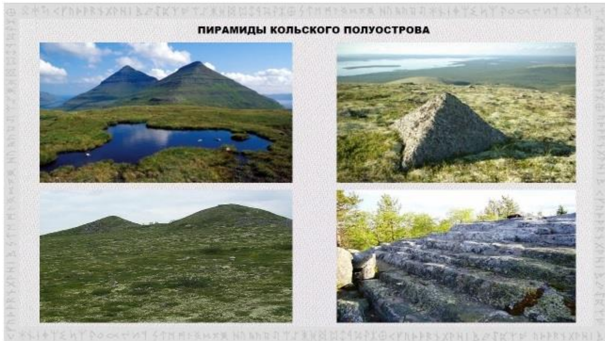
PYRAMIDS OF THE KOLA PENINSULA