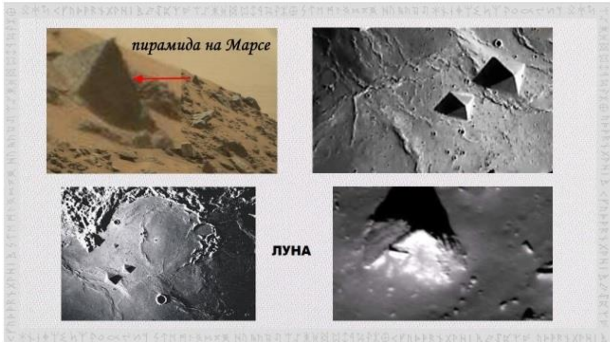
pyramid on Mars the moon

All the planets of the Solar System have pyramid complexes, and some of them are intended for processing "space debris". All pyramids on Earth are necessarily connected with Systems of command and control. Pyramids are included in the complex of structures of the Earth's Control System along with such structures as Control Systems, Communication Systems, Power Supply Systems, Control Complexes, etc.