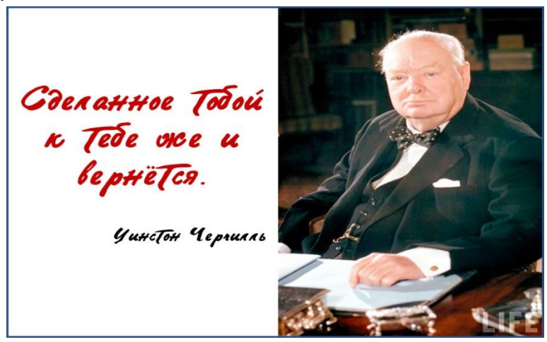
What You have sent will be returned to You. Winston Churchill