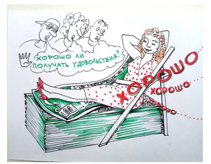
is it good to have fun? It is good... it is good... it is good...

Earthly values: human life, material goods and earthly pleasures formed the basis of the value system. Its foundation is not a worldview, but instincts. The spirit of the epoch permeated the leading part of humanity. Today, it is impossible to find a more developed society on the Planet, that by default, does NOT TAKE these attitudes for granted. It seems as natural as breathing. Any country, including Islamic ones, positioning themselves as the enemy of humanism and democracy, share the values of humanism in fundamental parameters. No one asks the question "from what do the highest values of humanism follow?". The inhabitants of our era consider them to be true only because THEY CORRESPOND to their instincts. People seem to ask their flesh: "Is it good to have fun?". She answers them: "It Is Good." This recognition is enough to elevate EVERYDAY TRUTH to the status of the HIGHEST IDEA, and consider everything else demagogy. The shortest way to realize everyday truths is money. The shortest way to get money is to take it away. This is ideal, because the profit is 100%, the investment is zero.