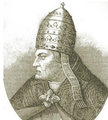
Папа Григорий VII

Power, first of all, is expressed in power OVER CONSCIOUSNESS . And only then over the territory and economy. If a ruler does not have power over consciousness, he is NOT a RULER , but a caretaker on the farm, at any moment changed by someone who has power over consciousness. The foundation of the Church, as one of the most important components of power, is the religious illiteracy of the masses. Ideally, people should understand as little as possible, and also NOT BE ABLE to read/write. The less they understand, the better — they will stand firmer in faith. As part of this policy, Pope Gregory VII 2 forbade good Christians to read the Bible. Since then, the opinion has